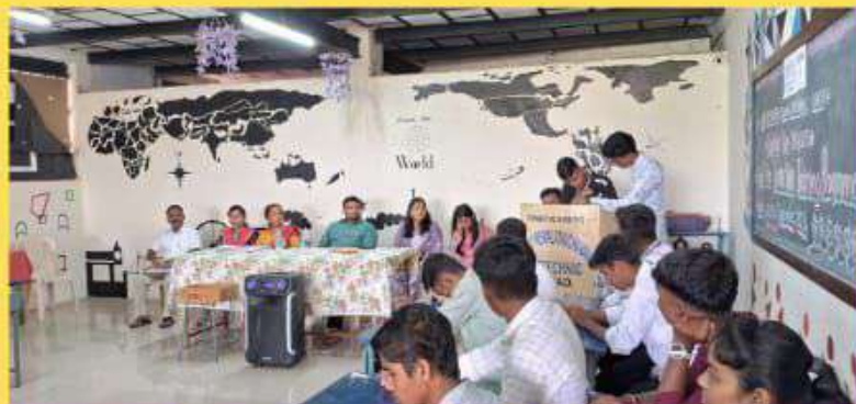
Actively participation of students for Quiz competition

On the occasion of Engineers' Day, the Department of Mechanical Engineering organized an interdepartmental quiz competition, Knowledge Wars. The event saw enthusiastic participation from students across various departments, testing their knowledge on engineering concepts, innovations, and history. The competition fostered a spirit of learning and collaboration while celebrating the contributions of engineers to society and technology.