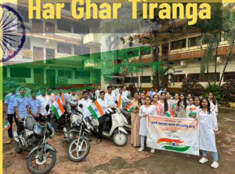
Initiating Bike Rally for awareness of "har ghar tiranga"