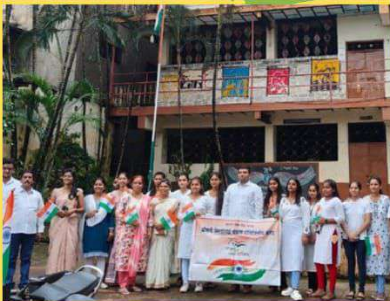
Celebrating Independence day at college