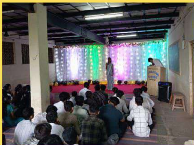
Active participation of students in various activities